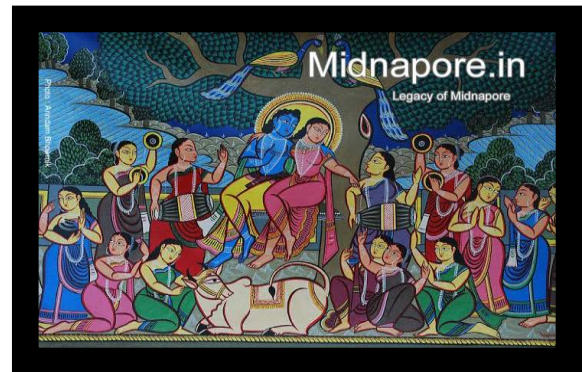
Figure 1 radha-krishna with sakhies patachitra of Midnapore.

Hindu epics like Ramayana and Mahabharata and it also relates the Hindu God and goddesses Radha Krishna, Chaitanya, Kali, Lord Shiba,. Most popular of this patachitra is Bengali folklore of Manasa Mangol, Chandi, Behula and Lakhinder.