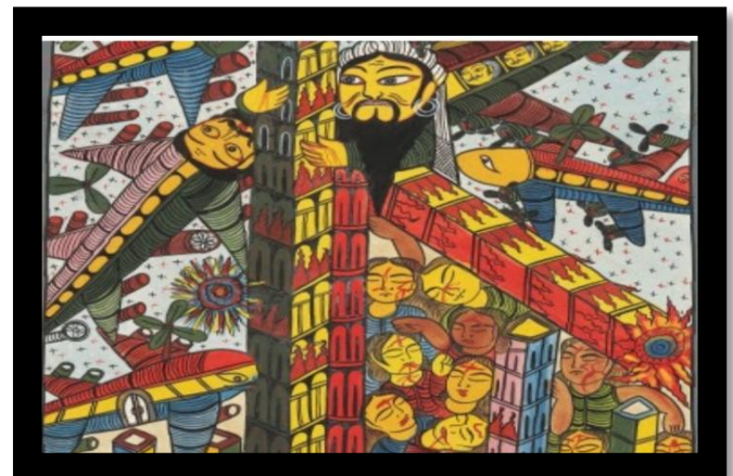
Figure-3 SwarnaChitrakar's Patachitra on 9/11.

Side by side they begin to represent the patachitra on the theme of 9/11 in USA.