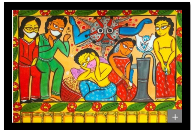
Figure -6It is done by SwarnaChitrakar of PachimMedinipur about Covid19.

Another different and dynamic style that falls under the title of patachitra, is the work of the jadupatuas from the santal tribe, the largest tribal community in India. Jadu pats generally depicted the tribal origin stories as well as scenes from marriage ceremony to different festivals. Jadu painters lack the vibrant color of other patuas. Yet they are incredibly important to the spiritual life of their community beyond the story tellers. On some festive occasions, they displays the paintings of sundry recurring topics of Ramayana and Mahabharata and even the paintings of the very current issues like 26/11 in Mumbai and Covid-19 pandemics. Etc.