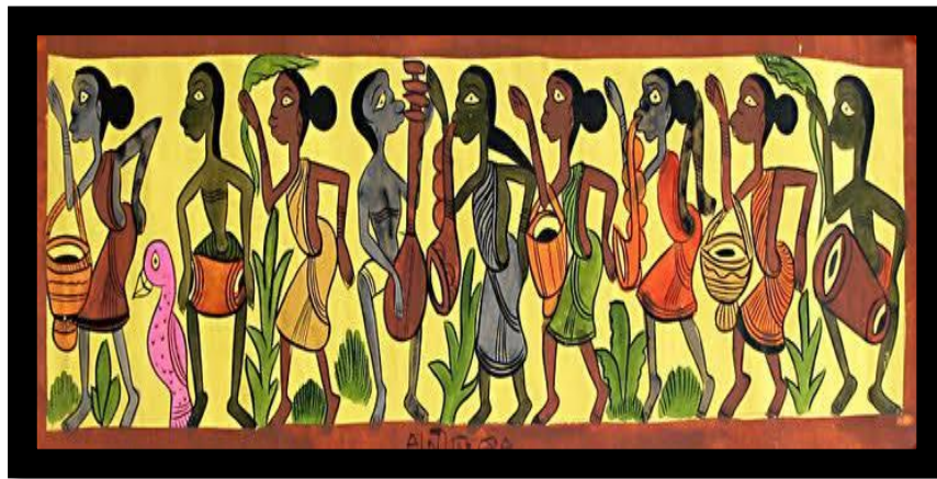
Figure-5 Tribal patachitra Bengal from joy roychoudhury's web log.

This patachitra is inspired by the aboriginal life and culture in West Bengal. Tribal people also moved forward to show their talent of artistic representations with their tribal culture and religion. Aboriginal life was once upon a time highly marginalized in the society but later on they appeared to be independent and powerful community that is economically, socially and culturally enriched. In various consumerist market the patachitra on indigenous culture and community is in high demand showing the existential survival of this artifacts in West Bengal.