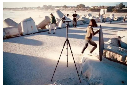
FIG.1 Samsung announces VR video camera

Photography is a basic course of art, media, journalism and other majors in ordinary colleges and universities, as well as a public elective course of art. Because of its close connection with students' life and learning, it is loved and valued by students. To learn photography well, students need to have both relevant theoretical knowledge and relevant operating skills [(Wang Dejiang and Zhang Jita, 2004)]. With the popularization of digital photography, students need to understand the application methods of relevant equipment in photography courses [(Cao Yan, Yu Jian, 2014)]. There are some shortcomings in the previous photography teaching mode, such as it is difficult to intuitively show students the imaging principle, focal length and other knowledge points, and it is difficult to explain and operate the camera parameter content. However, it will be more conducive to the smooth development of photography teaching to innovate the teaching means with the help of information technology and explore a new model of photography teaching based on digital technology[(FIG. 1 to FIG. 2)].