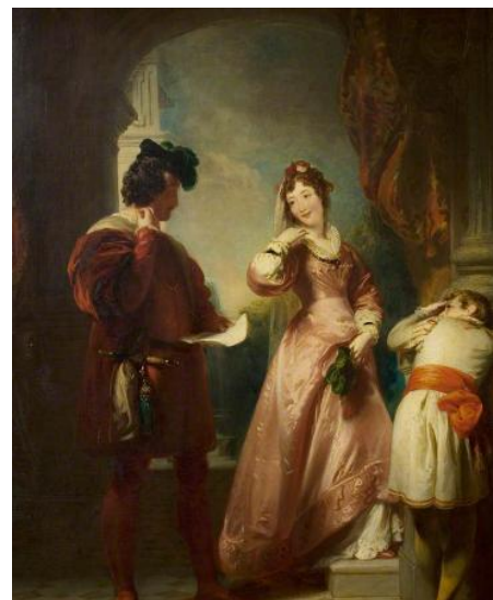
Figure 2: The conditions of Brothel as per "Two Gentlemen of Verona"

Another significance of the writing piece of Malik Muhammad Jayasi is associated with indicating the different violent activities as well as criminality in colonial India, especially in 16 and 17 centuries. From the literature of Padmavat, the author has portrayed several pictures related to child wives or child marriage, the practice of "Sati" and prostitution, which were common in India at that time. For example, the end of the play Padmaavat directly shows the self-sacrifice of Queen Padmavati, in order to protect her honour from the intruders, which is still considered one of the most significant events in Indian history (Atwal, 2019). On the other hand, similar writing has been found from the writing of Shakespeare, where several the pieces of literature of brothel and sex workers in his play named, "Two Gentlemen of Verona" (Cox, 2021). Therefore, it can be said, the social relationship and conditions of these sex workers in India and Western countries are kind of similar, which has been portrayed by both of the authors.